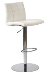
Contemporary Bar Stool