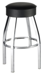
Leather Padded Bar Stool