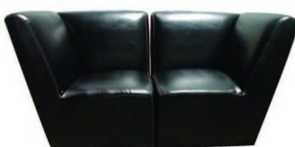
Loveseat (2 Corner Chairs)