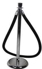
Chrome Stanchion 8' Stanchion Rope