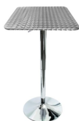
Stainless Steel Bistro Table