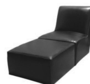
Armless Lounger (Armless Chair & Ottoman)