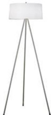
Modern Floor Lamp