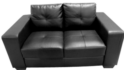
Traditional Love Seat