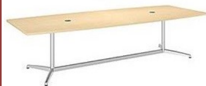
Maple Conference Table