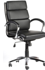
Elite Executive Chair