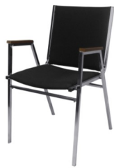
Black Fabric Arm Chair