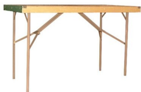
Plain Tables 4', 6', & 8' lengths available