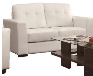
Contemporary Love Seat