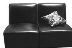
Armless Loveseat (2 Armless Chairs)