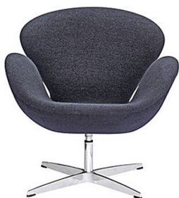
Grey Swan Chair