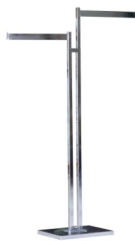
Chrome Bag Rack