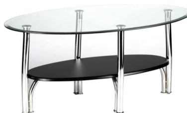
Glass Coffee Table