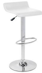
Leather Gelato Bar Stool