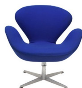
Blue Swan Chair