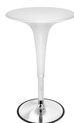
White Gelato Table