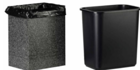
Wastebasket (Disposable or plastic)