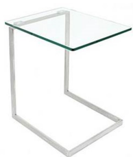
Modern End Table