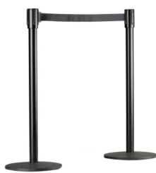
Stanchion w/Black Retractable Belt