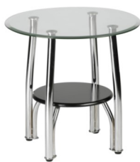
Glass End Table