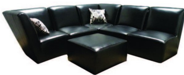
6-piece Sectional with Ottoman