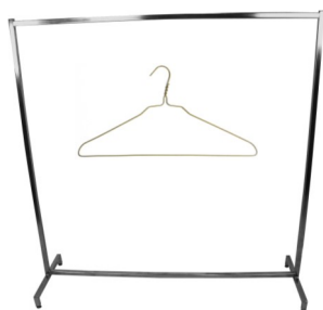
Coat Rack w/20 hangers