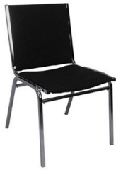
Black Fabric Chair