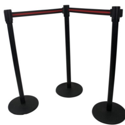
Stanchion w/Red Retractable Belt