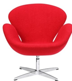
Red Swan Chair